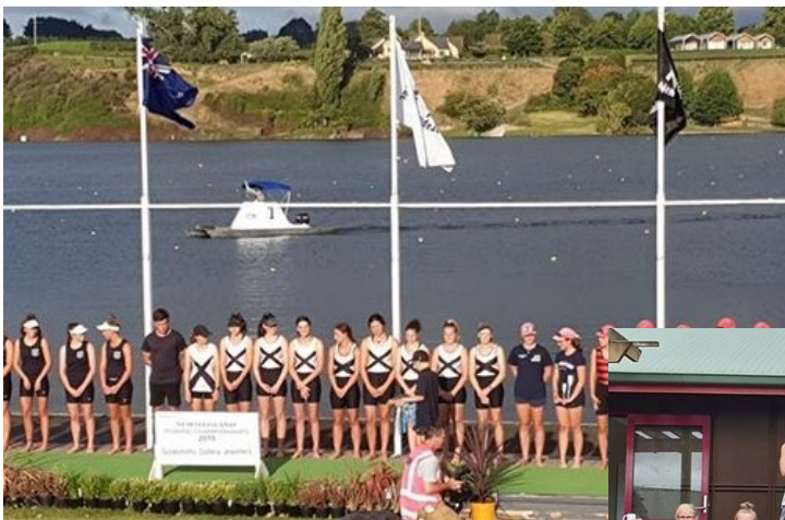
GRC rowers at Lake Karapiro 2019

From February our focus shifts to the school rowing season with North Island Secondary Schools Champs and Maadi Cup regattas at Lake Karapiro and Twizel in March. The Maadi Cup Regatta is one of the largest school events in the Southern Hemisphere.